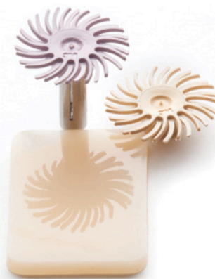
Filtek™ Supreme Ultra Universal Restorative polished with Sof-Lex™ Diamond Polishing System