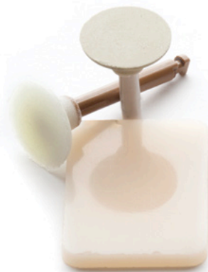
TPH Spectra® Universal Composite polished with Enhance® Finishing System and PoGo® Polishing System

Notice a clearer reflection when Filtek™ Supreme Ultra Universal Restorative is polished with the Sof-Lex™ Diamond Polishing System.